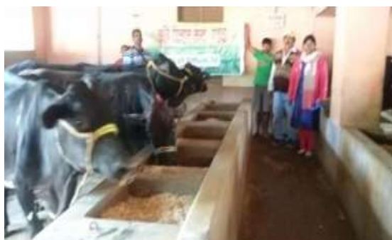
Fig 3: Feeding of paddy straw only