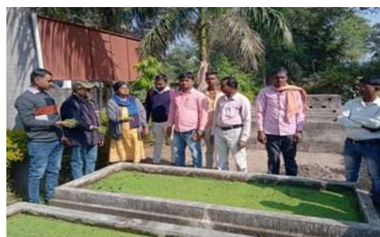
Fig 2: Training and Demonstration of Azolla cultivation