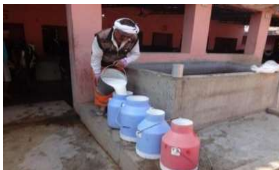
Fig 4: Milk production