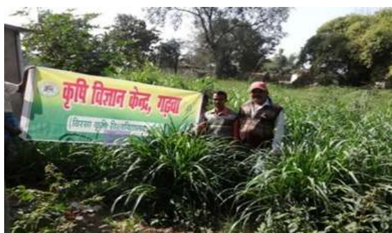
Fig 1: Hybrid napier cultivation