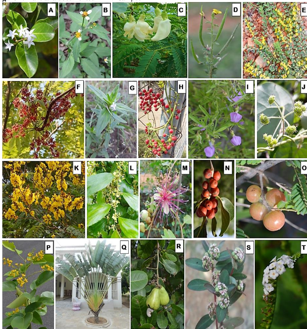
Figure 2. Plant taxa documented in AV Campus

A: Carissa spinarum ; B: Bidens pilosa ; C: Sesbania grandiflora ; D: Cleome viscosa ; E : Crotalaria hebecarpa ; F : Sterculia foetida ; G : Spermacoce auricularis ; H : Tinospora sinensis ; I : Hybanthus enneaspermus J : Cyclea peltata ; K : Peltophorum pterocarpum ; L: Ziziphus jujuba ; M: Capparis zeylanica ; N : Ficus benghalensis ; O : Phyllanthus emblica ; P : Pterocarpus santalinus ; Q : Ravenala madagascariensis ; R : Anacardium occidentale ; S : Euphorbia hypericifolia ; T : Heliotropium indicum