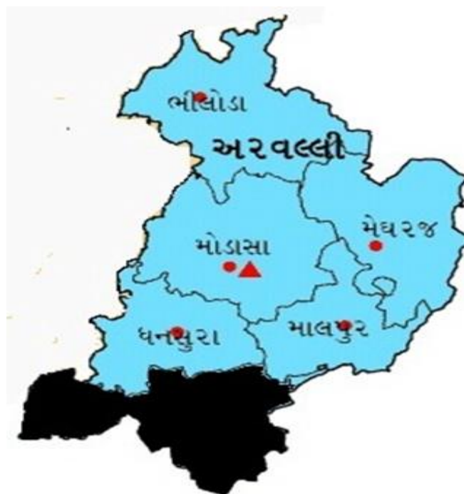
Map showing location of study area

The Aravalli district is situated in the north-eastern part of Gujarat State between 23°03'-24°30' N latitudes, and 72°43'-73°39' E longitudes. The area is undulating terrain of Aravalli hillocks. The forest is mainly of Dry Mixed Deciduous type with rich floristic diversity. The predominant scheduled tribe in the area is Bhil, Dungari Garasia, etc.