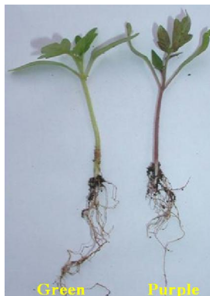
Figure 2: Seedling Hypocotyl Colour

Seedling Morphology: Expression of different characteristics of seedlings like pubescence, pigmentation etc., are found to be varietal specific and helps in early identification of tomato cultivars at seedling stage itself and there by saves time. Purple pigmentation was absent only in Nandi, Sankranthi and Vybav and can be readily employed as an efficient marker to identify these cultivars (Fig 2). With respect to intensity of pigmentation only four cultivars viz., Arka Alok, Pusa Early Dwarf, 128/M 131 and M-03/868 exhibited high hypocotyl colour intensity. As all the cultivars exhibited hypocotyl pubescence, this trait was not useful even for grouping of the cultivars and only hypocotyl colour and its intensity could be used to differentiate tomato cultivars at seedling stage. Thus seedling morphological traits were found to be useful only for broader classification of genotypes into different groups but not for identification of individual cultivar. Although, these characters are in use for a long time till today (Arya and Saini, 1976 in chilli; and Harris and Beever and 2000, in cabbage) for varietal characterization, their utility appears to be doubtful as these characters are quantifiable in nature and are subjected to environmental fluctuations.