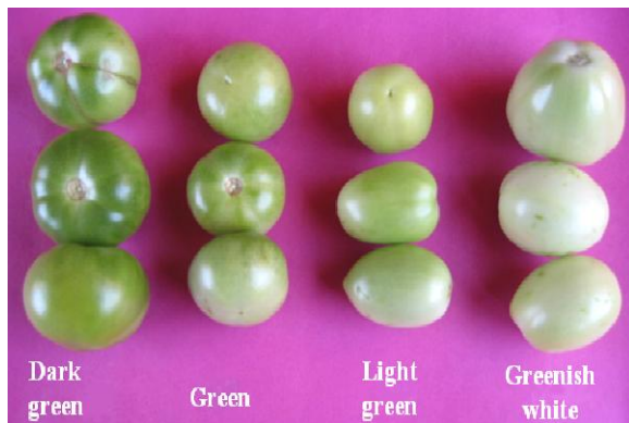
Figure 3: Exterior colour of immature fruit

consciousness this character can be used to identify cultivars.