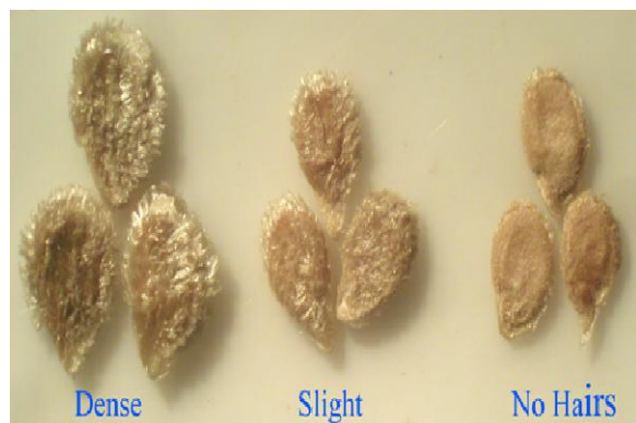
Figure 1: Seed Hairiness

characters are not unique to most of the studied cultivars and could not able to identify the cultivars unequivocally except Sankranthi and Vybav. Hence these characters can be used only for grouping the cultivars and to identify few cultivars.