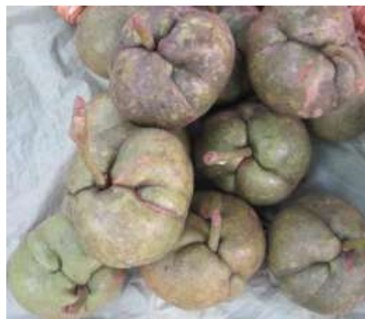
Morinda citrifolia Dillenia indica