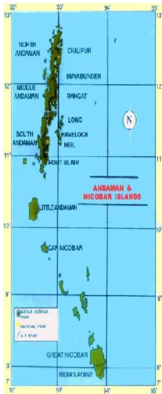
Map of India and Andaman and Nicobar Islands